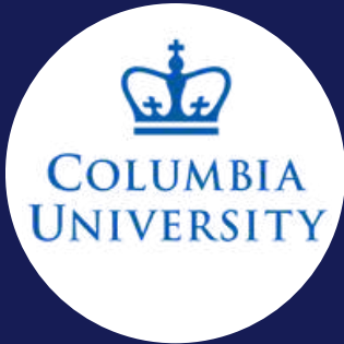
Charlotte Quek Natural Sciences